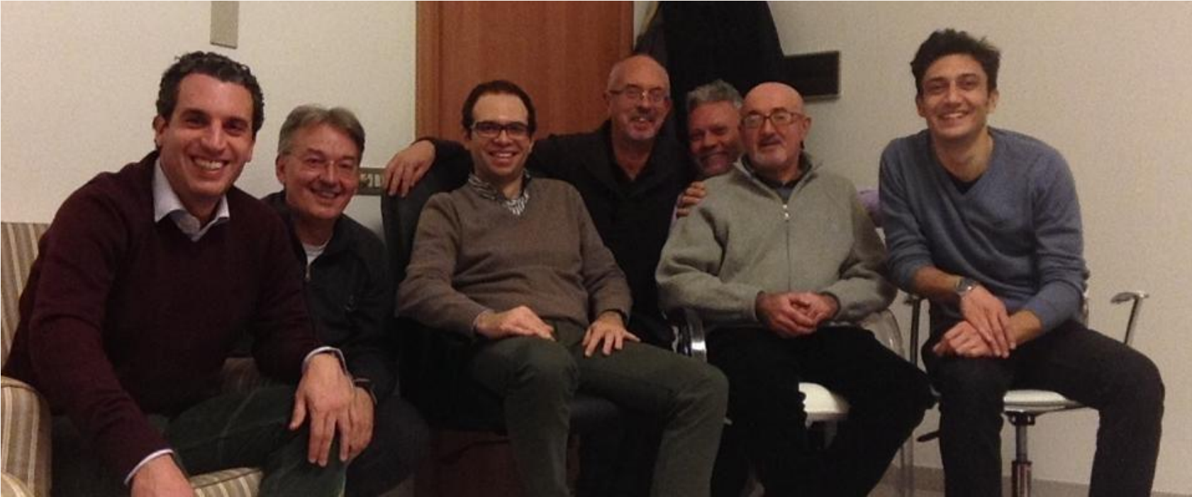
2008 – Gruppo di Condivisione L.U.I. (Men's Sharing and Awareness Group)